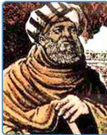
826 - 901 Thabit Ibn Qurra